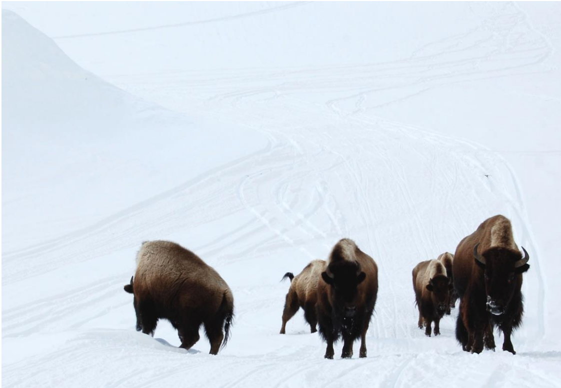
Yellowstone bison, Hebgen Lake, West Yellowstone, Montana, March 2008. These bison were hazed to a trap on private lands operated by the Montana Dept. of Livestock, loaded onto trailers and shipped to slaughterhouses.

Since its inception in 2000, the multimillion dollar taxpayer funded Interagency Bison Management Plan has eliminated over 3,200 wild buffalo from the Yellowstone ecosystem, mainly on public lands in America's flagship Yellowstone National Park and the Gallatin National Forest.