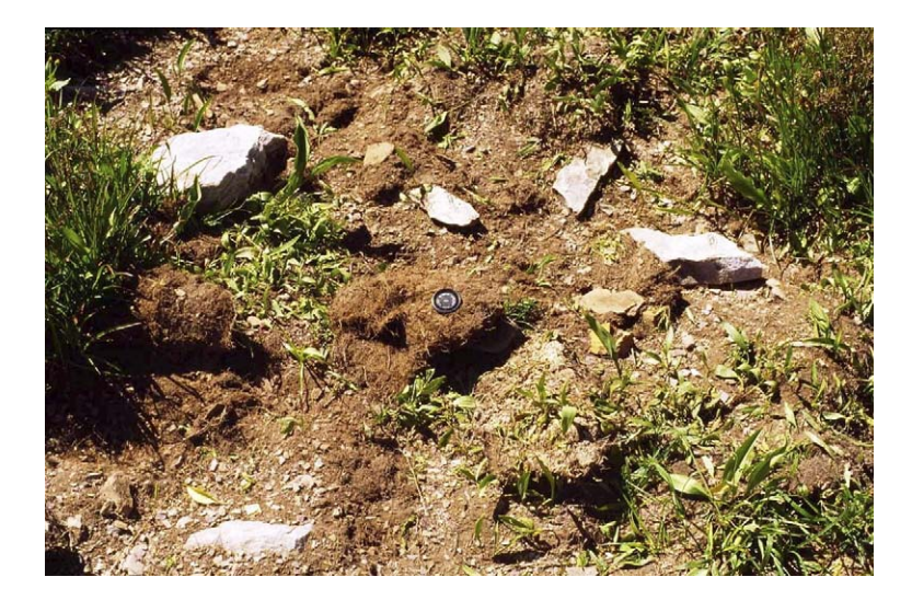
Fig. 5. Area excavated by grizzly bear in search of tubers and roots. Note the 49 mm lens cap for scale.

Although the study of the geomorphic impacts of native animal species on the Australian landscape is an area of increasing interest (e.g., Bennett, 1999; Eldridge and Rath, 2002), the impacts of native species on the Australian landscape has been overshadowed by research