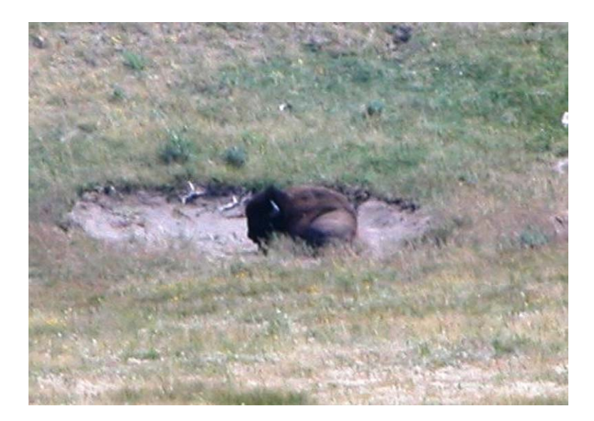
Fig. 2. Bison in so-called "buffalo wallow" in shortgrass prairie, Waterton Lakes National Park, southwestern Alberta, Canada.

loading of slopes. The latter activity has not been described in detail for bison, and is not examined further here.