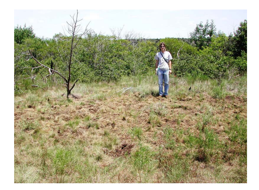
Fig. 6. Area trampled and rooted by feral hogs, central Texas, USA.

Feral burros and horses are pests with significant geomorphic impacts in the western United States and in Australia (Symanski, 1994; Pimentel et al., 2000; Dukes and Mooney, 2004; Edwards et al., 2004), although data on specific numbers of each are controversial (Symanski, 1994). Feral burros, Equus asinus, and feral horses (Equus caballus) are common animals in many areas of the American southwest (Hanley and Brady, 1977; Pimentel et al., 2000) as well as in Australian rangelands (Edwards et al., 2004). They graze on, and drastically reduce, native vegetation so that native perennials are replaced by annuals. The grazing also reduces the overall surface vegetation cover and exposes a greater area to raindrop impact, surface runoff, and sediment dispersal (Hanley and Brady, 1977). They also presumably contribute to widespread erosion (Edwards et al., 2004) via the "trampling" process as illustrated schematically by Hall and Lamont (2003) (Fig. 1). These direct erosional impacts, as well as the secondary erosional impacts attributable to vegetation cover change and overall reduction of vegetation, have been qualitatively observed but are completely unquantified in the geomorphic literature.