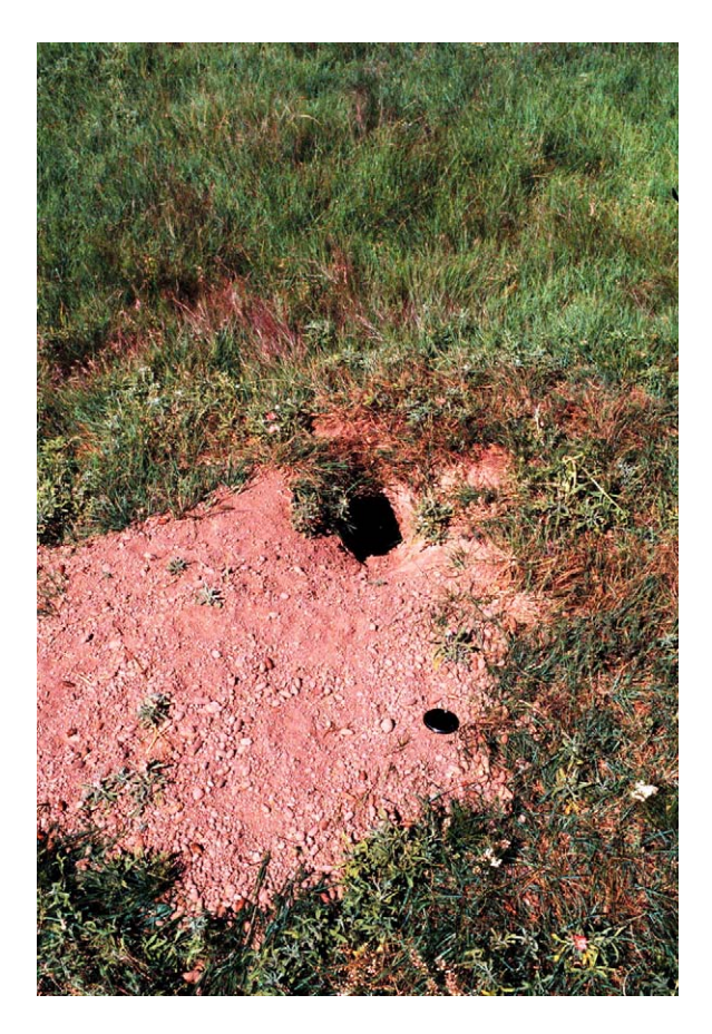
Fig. 4. Typical entrance to a prairie-dog burrow in Devils Tower National Monument, northeastern Wyoming, USA. Note the associated sediment mound with 49-mm lens cap for scale.

until European Contact (Lomolino and Smith, 2001). Over 40 million hectares of the prairie region were occupied by black-tailed prairie dogs in the early 1900s (Senseman et al., 1994), an area representing more than 20% of the natural short- and mixed-grass prairies (Whicker and Detling, 1988). Since the early 1900s, the range of the prairie-dog has been reduced to less than 600,000 ha by eradication efforts associated with American agriculture (Lomolino et al., 2003). In Texas alone, historic populations of black-tailed prairie dogs were estimated in the early 20th Century at 800 million individuals occupying over 230,000 km<sup>2</sup>; eradication efforts and land-use changes have reduced the Texas population by greater than 99% (Weltzin et al., 1997).