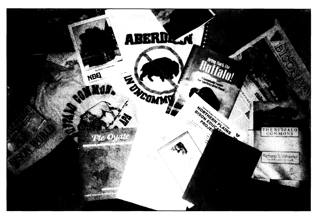
Fig. 2—The Buffalo Commons in print, November 1999.

well either environmentally or economically, replacement uses that treated the land more lightly would become inevitable (Figure 1). The federal government would oversee the replacement, and the new land uses would fall between intensive cultivation and extraction on one hand and wilderness on the other. We saw in the Buffalo Commons the potential for a serious but long-term proposal, a public-policy response to deep-seated trends. But we relied on metaphor to give shape and words to the intrinsically unknowable and unpredictable, the Great Plains' future.