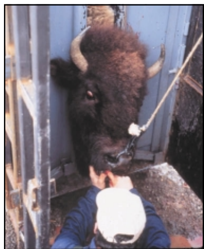
A wild buffalo being tested in a DOL capture facility.