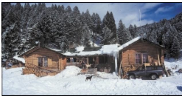
Buffalo Field Campaign headquarters on Hebgen Lake near West Yellowstone, Montana.