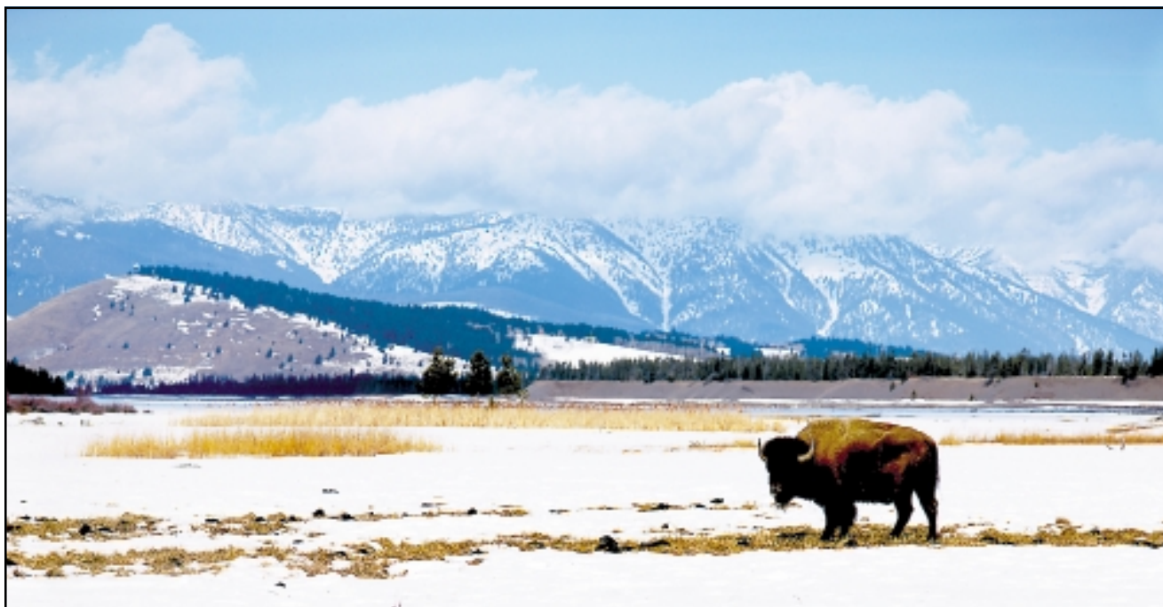
A lone buffalo grazes along the Madison Arm of Hebgen Lake. Horse Butte is in the near-left background, with the capture facility located near its base.

"MCA 2-6-102. Citizens entitled to inspect and copy public writings. (1) Every citizen has a right to inspect and take a copy of any public writing of this state."