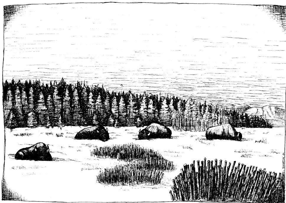
2/05/01 WILD BUFFALO IN HOUDINI'S MEADOW WEST YELLOWSTONE MONTANA