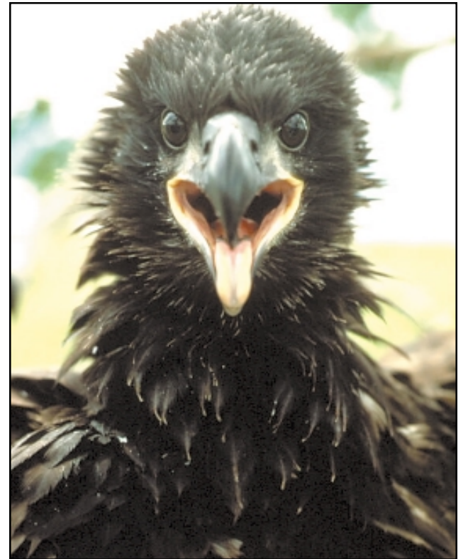
Mature and immature bald eagles (above).