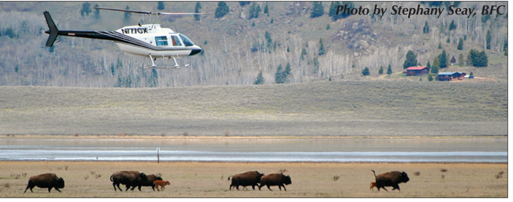
A low-flying MT Department of Livestock helicopter trespassing over the private lands of Yellowstone Ranch Preserve, where buffalo are welcome and hazers are not.

and lifted, making more room between the strands. Another buffalo reached her head through and gently nudged the calf.