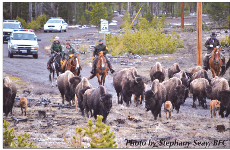
Montana Department of Livestock; Montana Fish, Wildlife and Parks; National Park Service; and U.S. Forest Service agents working together to harass wildlife on our public lands.

We'd been on our way to complete a barbed-wire fence removal project on National Forest land. Another group of volunteers, including children and their moms, were headed