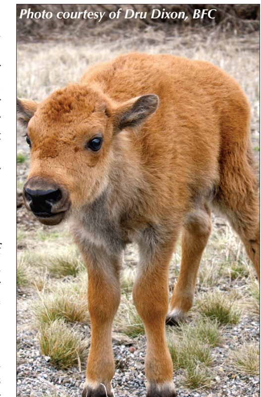
Take action today and help spare this little guy from harassment tomorrow!

Subscribe to BFC's weekly email newsletter. Send your email address to bfc-media@wildrockies.org or visit www.BuffaloFieldCampaign.org for more information.