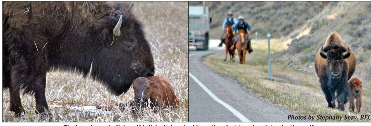
The brand-new buffalo calf is licked clean by his mother. Just two days later the tiny calf was hazed. Buffalo Field Campaign volunteers were on hand to document both the birth and the subsequent hazing – your support and only your support keeps our patrols in the field.

This spring the USDA Animal and Plant Health Inspection Service (APHIS) tranquilized and ejaculated 39 bull bison to determine if their semen contained brucellosis. Because wild bison don't mate with domestic cattle, the study is irrelevant. After taking semen, scientists painted the buffalo with blue stripes, revived them with reversal drugs, and left them to wander – confused, agitated, and alone. The APHIS study was suspended after two bulls had an adverse reaction, became uncharacteristically aggressive, and were killed. Contact MT FWP! Urge them to permanently rescind APHIS' permit for the study: Joe Maurier, 406-444-3186, jmaurier@mt.gov