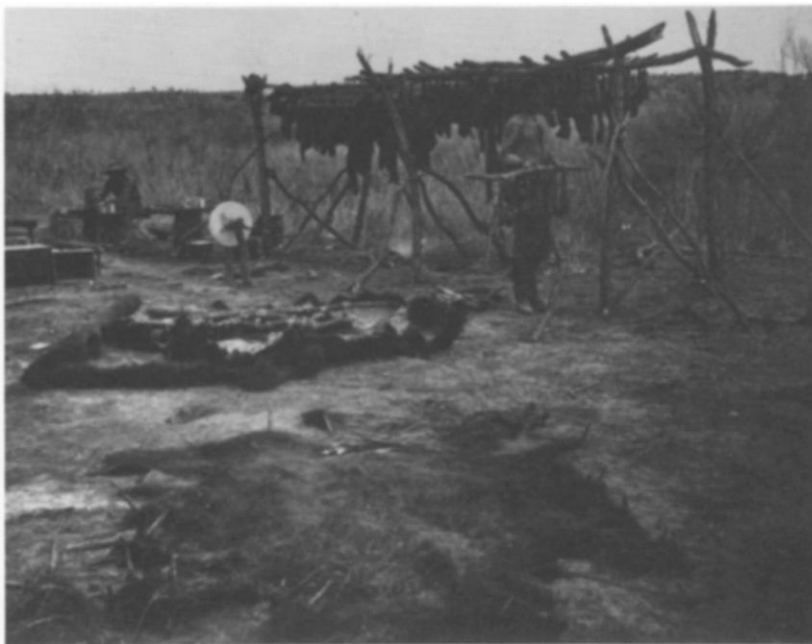
Buffalo hunters camp, Texas Panhandle, 1874.