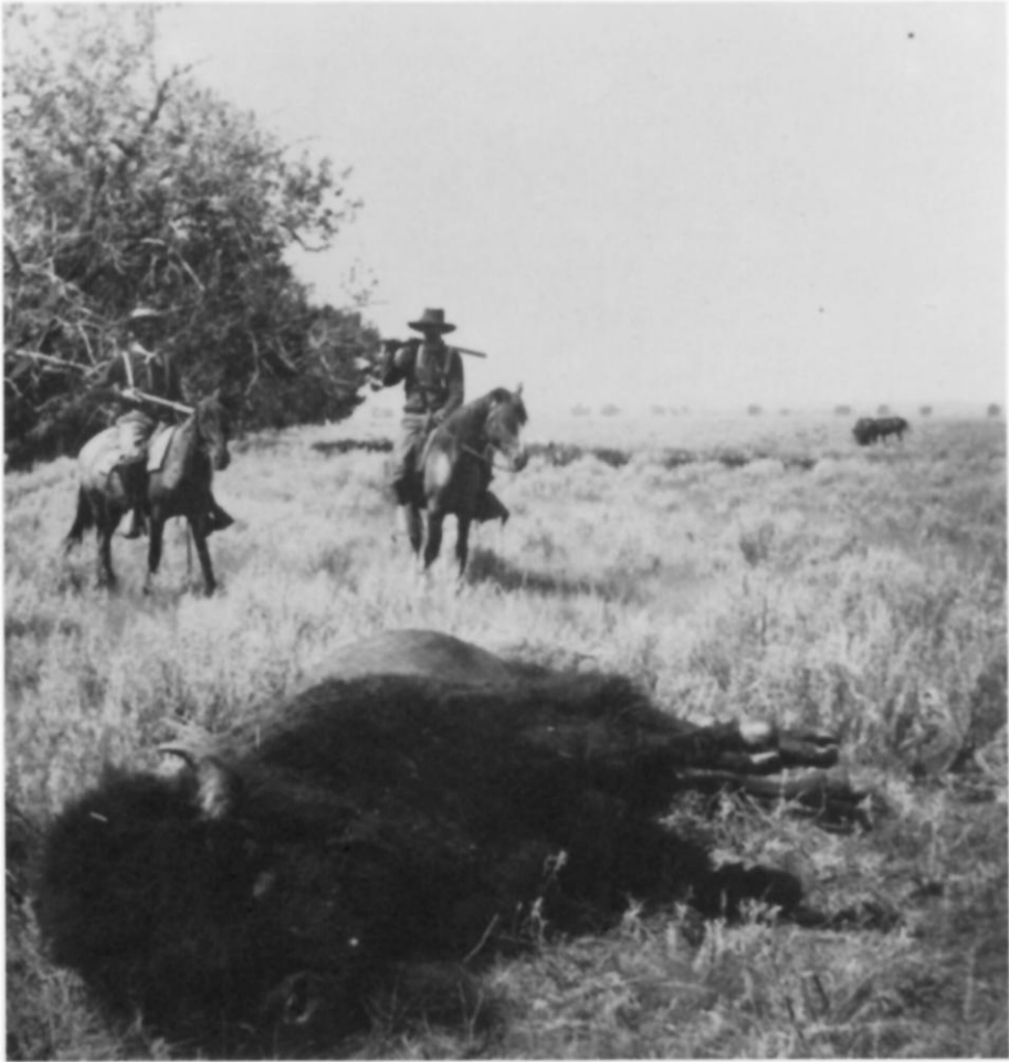
Buffalo hunting, Montana, 1882.