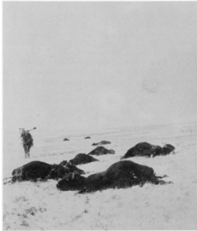
Buffalo killed, Smoky Butte, Montana.

accomplished soldier marksmen and riders as escorts for the visitors, thereby making the hunts all the more destructive. 10