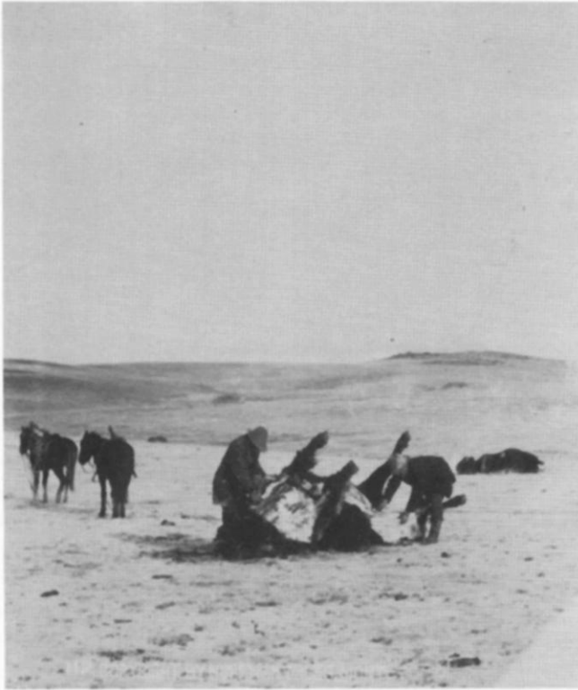
Buffalo Skinners at Work.