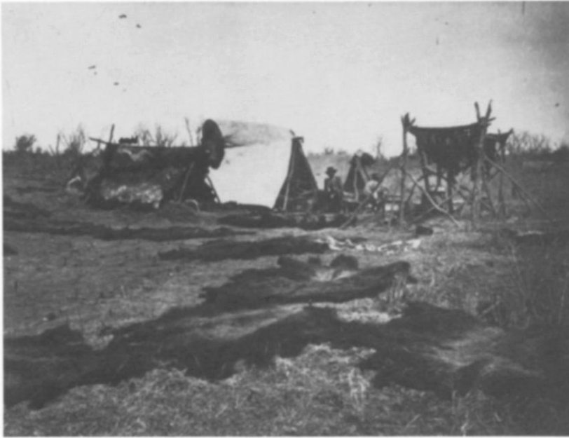
A buffalo hunting camp in Texas.