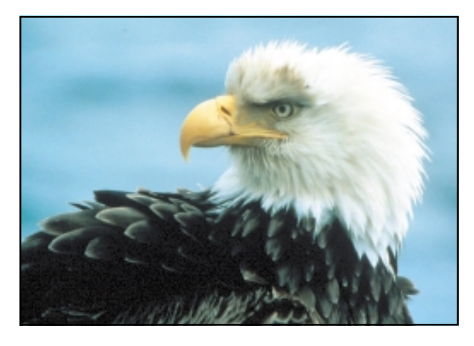
Montana DOL helicopters were illegally deployed to haze and capture Yellowstone's native buffalo, disturbing habitat of threatened bald eagles and sensitive wildlife.