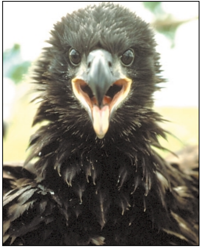
Mature and immature bald eagles (above).