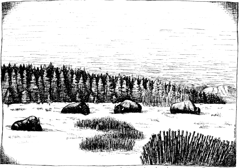
2/05/01 IN HOUDINI'S MEADOW WILD BUFFALO WEST YELLOWSTONE MONTANA