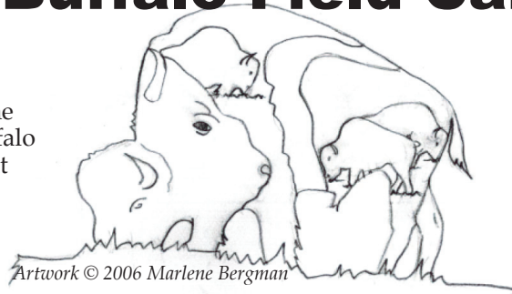
Artwork © 2006 Marlene Bergman