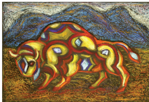
"The Painted Buffalo" © 2006 Marian Osher.

BFC's weekly email Updates from the Field educate and inform bison advocates around the world with the latest news affecting the Yellowstone herd. Updates include concrete actions you can take to help protect the buffalo. To subscribe, send an email to: bfc-media@wildrockies.org .