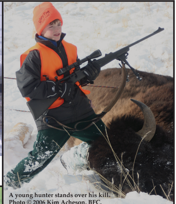
A young hunter stands over his kill.