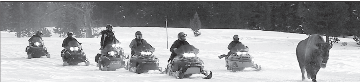
Six Montana Department of Livestock agents waste tax dollars to haze a lone bull buffalo out of Montana. In light of the fact that bulls can not transmit brucellosis, such actions reveal that Montana's intolerance for bison has more to do with prejudice against bison than with fear of disease transmission.