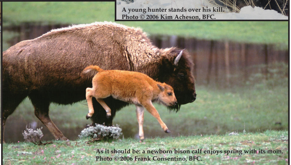
As it should be: a newborn bison calf enjoys spring with its mom.