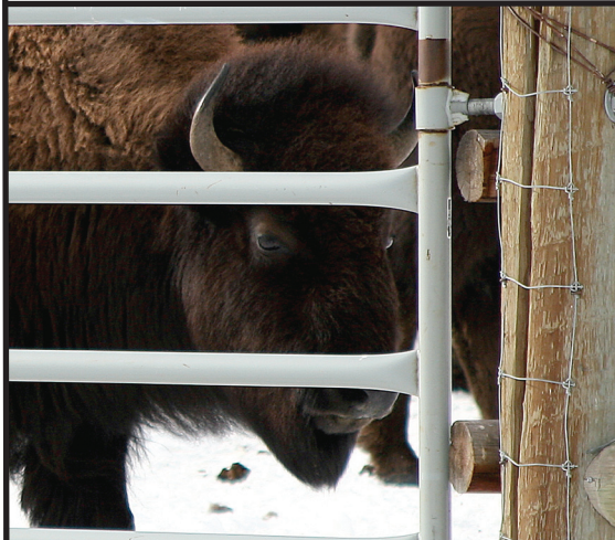
Awaiting shipment to slaughter in the Stephens Creek bison trap within Yellowstone National Park.