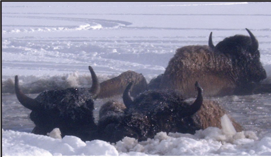
On January 12, 2006 the Montana Department of Livestock suspended the bison hunt to haze a herd that was grazing within Montana's "tolerance" zone. After agents pushed them onto the thin ice of Hebgen Lake, 14 bison broke through and two drowned.