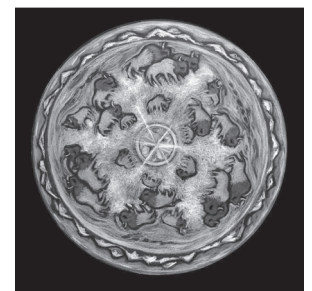
"Love, Respect, Protect the Yellowstone Bison" © 2006 Marian Osher

Use the order form above to order BFC bumper stickers, notecards, and tee shirts. Bumper stickers (pictured here) are brown on white background. The black and white reproduction of the "Love, Respect, Protect" notecard mandala (below) doesn't do justice to Marian Osher's vibrant colorful design. All purchases benefit BFC's frontlines work.