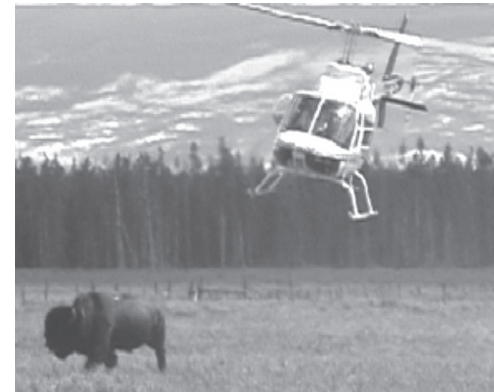
DOL agents use a helicopter to chase a previously captured, brucellosis-free bull buffalo.