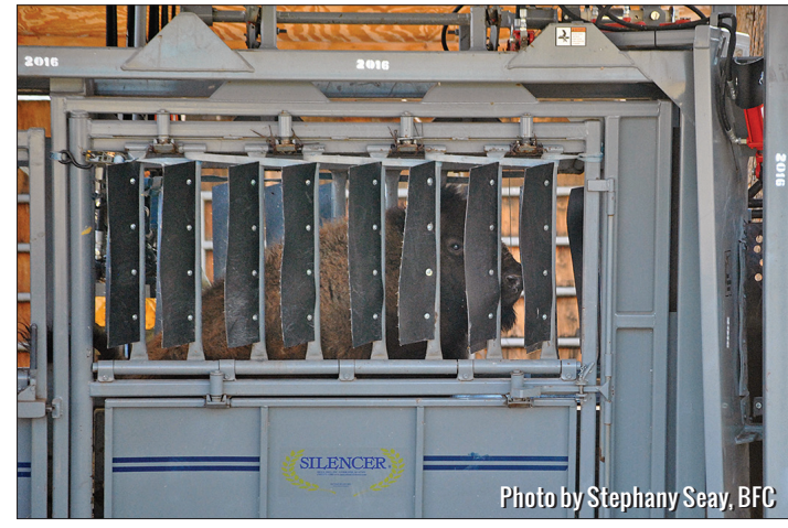
The "Silencer", one of many horrors of Yellowstone's buffalo trap.

Stephens Creek leads only to slaughter or quarantine, NPS and other agencies to decimate our last wild herds. Yellowstone is currently seeking approval for a fiftyyear quarantine plan to remove buffalo from their native lands and ship them to places where they will become livestock. Of the one hundred fifty buffalo captured in 2016, ninety-seven were slaughtered, while fifty-three continue to be confined in the trap as Yellowstone awaits approval of its quarantine plan. Slaughter and quarantine are the direct result of the livestock industry's powerful influence: The next step is to challenge both are inappropriate, unethical, and unnecessary