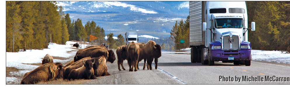
Safe passage infrastructure-bridges or underpasses constructed in key migration areas-allow wildlife to move through the landscape without having to step foot on the highway.

Yellowstone is a dangerous stretch, claiming the lives of more than one hundred buffalo since 2005. These highway mortalities not only threaten the viability of America's last wild bison population but also the lives of motorists. Urge Montana Department of Transportation Director Mike Tooley other ways you can spread the word to and Governor Steve Bullock to earmark save the herds! Call (406) 646-0070 or highway funding to implement email buffalo@wildrockies.org.