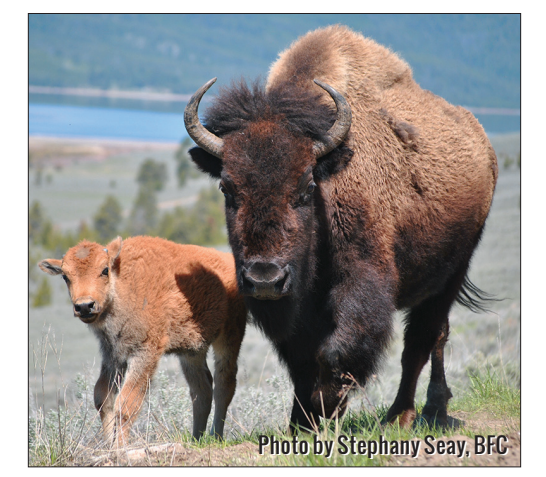
Buffalo raise their calves in peace on the National Forest lands of Horse Butte.

The spring of 2016 is the first time buffalo have been left in peace on Horse Butte, a favored habitat comprised largely of National Forest and